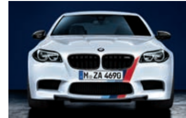
Front and rear stripes