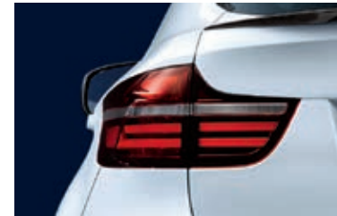
Black Line rear lights