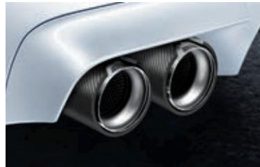
Exhaust tailpipe finishers, carbon