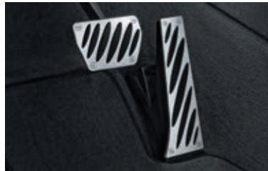
Aluminium pedal covers