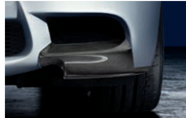
Front splitter, carbon