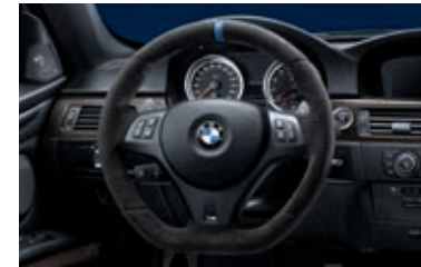
Alcantara steering wheel