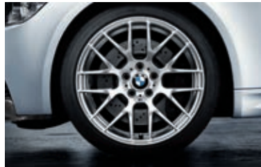
19" Y-spoke 359 M