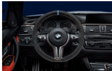
Alcantara steering wheel II with carbon trim