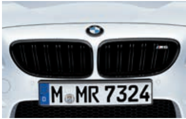
Front grille, black