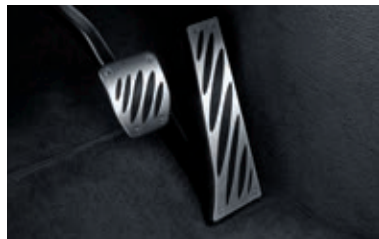
Aluminium pedal covers