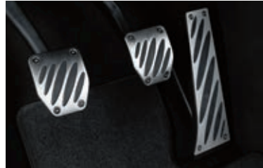
Aluminium pedal covers