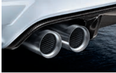
Exhaust tailpipe finishers, titanium