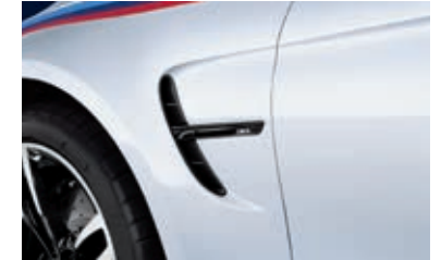
Side grilles, high-gloss black