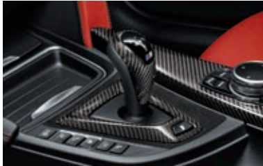
Carbon gear lever trim/ centre console gear lever trim in Alcantara and carbon