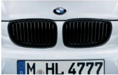
Front grille, black