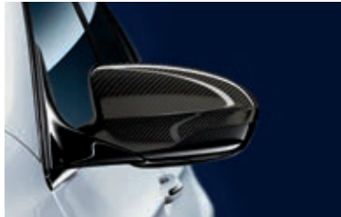
Exterior mirror covers, carbon