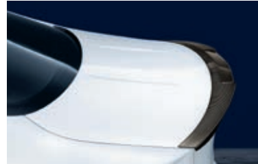
Rear spoiler, carbon