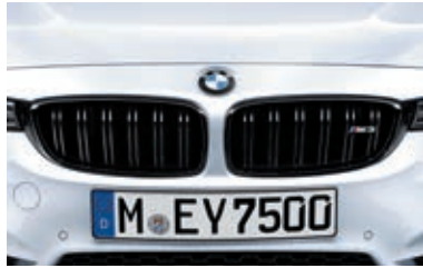
Front grille, black