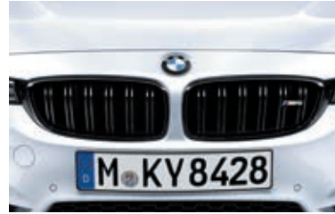
Front grille, black