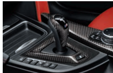
Carbon gear lever trim/ centre console gear lever trim in Alcantara and carbon