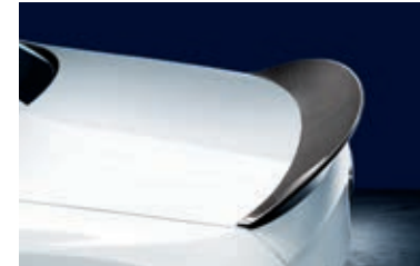
Rear spoiler, carbon