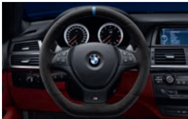
Alcantara steering wheel