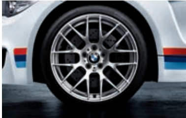
19" Y-spoke 359 M