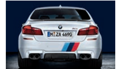
Front and rear stripes