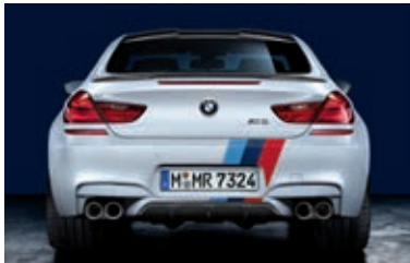
Front and rear stripes