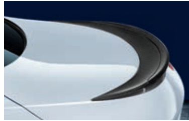
Rear spoiler, carbon