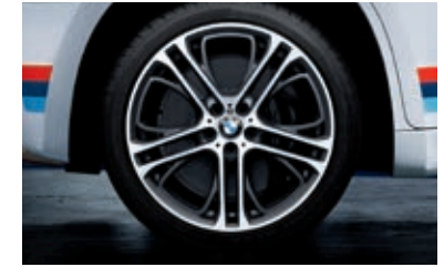
21" Double-spoke 310 M