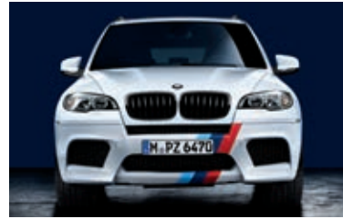
Front and rear stripes