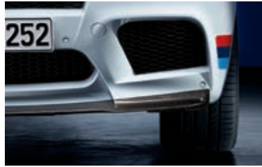
Front splitter, carbon