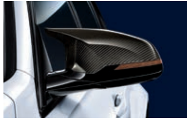
Exterior mirror covers, carbon Available in 2015.