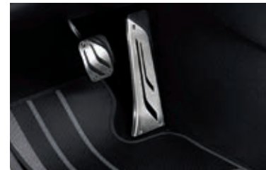
Pedal covers, stainless steel