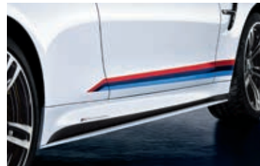
Side sill trim and decal