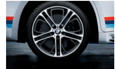
21" Double-spoke 310 M