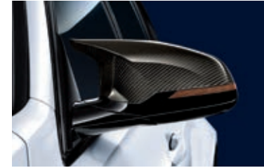
Exterior mirror covers, carbon