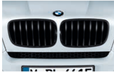
Front grille, black