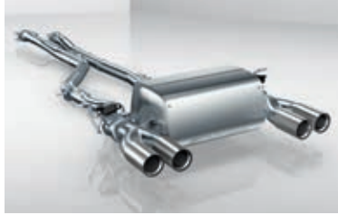
Exhaust system, titanium