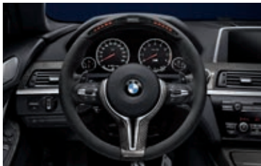
Alcantara steering wheel II with carbon trim and race display 1