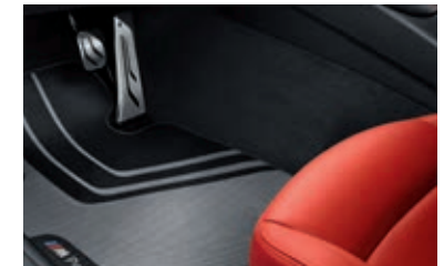
Pedal covers, stainless steel/ Floor mats