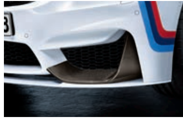
Front attachment, carbon