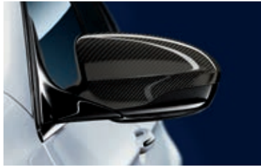
Exterior mirror covers, carbon