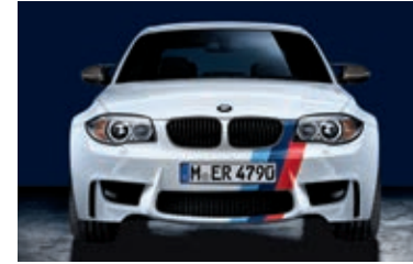
Front and rear stripes