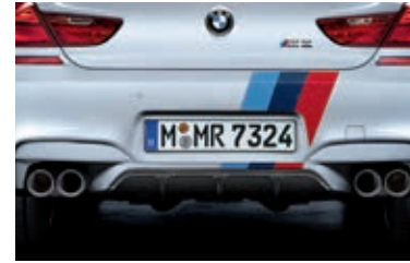
Rear diffuser, carbon