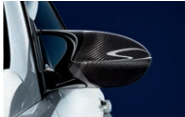
Exterior mirror covers, carbon