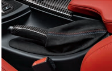
Handbrake grip, carbon with Alcantara gaiter