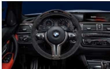
Alcantara steering wheel II with carbon trim and race display 2