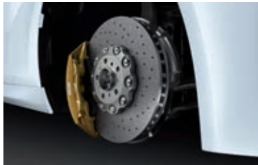
Carbon ceramic brakes