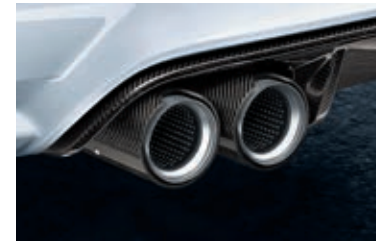
Exhaust tailpipe finishers, carbon