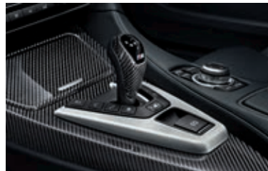
Gearshift lever, carbon trim