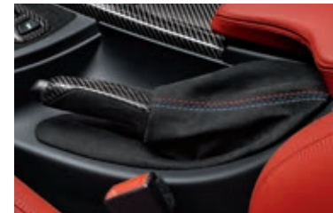
Handbrake grip, carbon with Alcantara gaiter