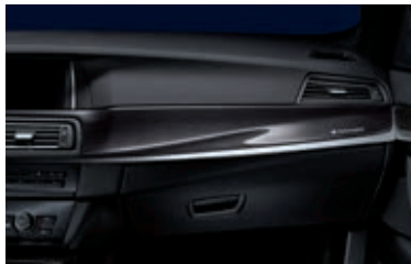
Carbon interior trim