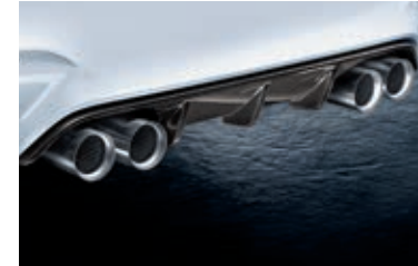
Rear diffuser, carbon