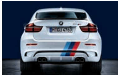
Front and rear stripes