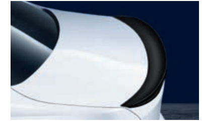
Rear spoiler, matt black 1