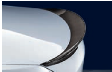
Rear spoiler, carbon