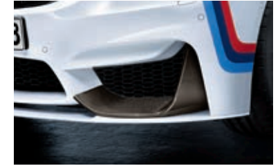
Front attachment, carbon