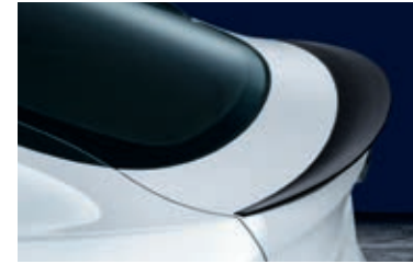
Rear spoiler, matt black 1