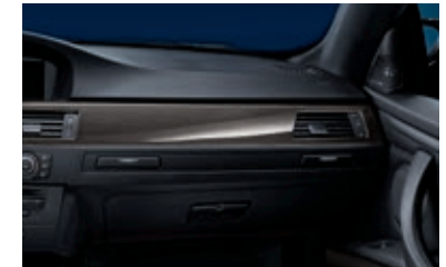
Carbon interior trim