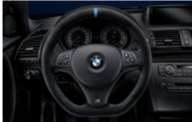
Alcantara steering wheel