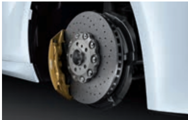
Carbon ceramic brakes