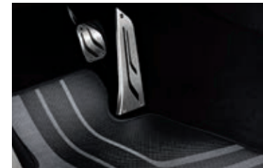
Pedal covers, stainless steel