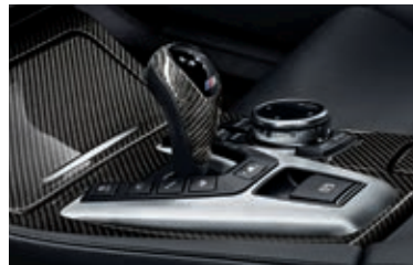
Gearshift lever, carbon trim