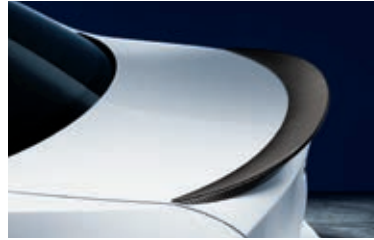
Rear spoiler, carbon