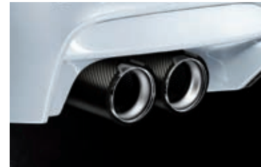
Exhaust tailpipe finishers, carbon