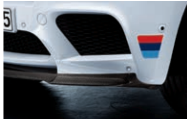
Front splitter, carbon