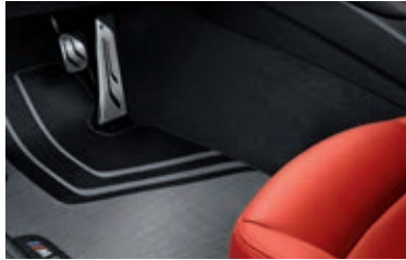
Pedal covers, stainless steel/ Floor mats