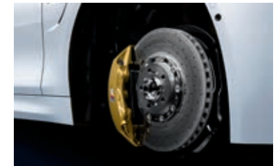
Carbon ceramic brakes