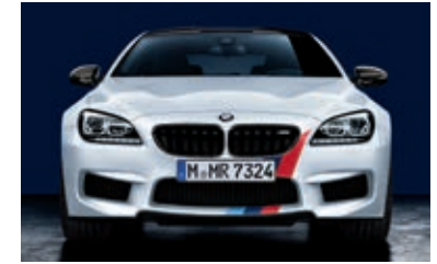
Front and rear stripes