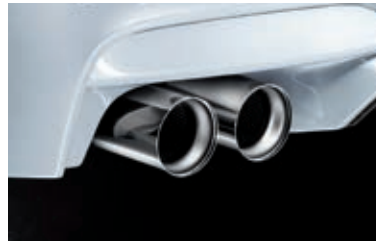
Exhaust tailpipe finishers, titanium