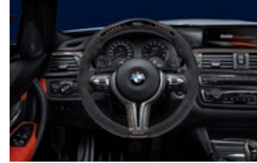
Alcantara steering wheel II with carbon trim and race display 1