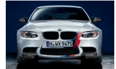
Front and rear stripes