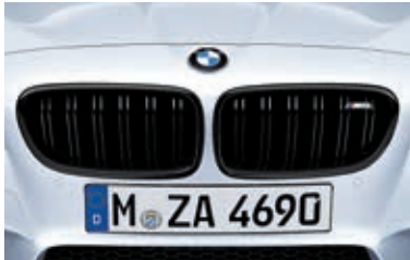
Front grille, black