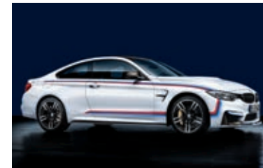
Motorsport side stripes