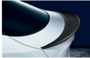
Rear spoiler, carbon