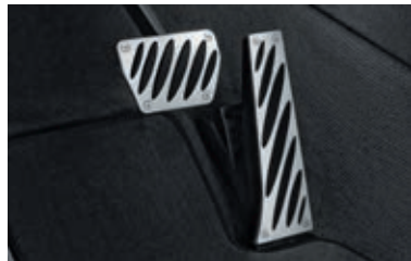
Aluminium pedal covers