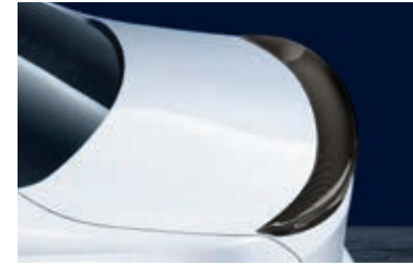
Rear spoiler, carbon