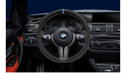
Alcantara steering wheel II with carbon trim