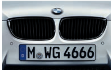
Front grille, black