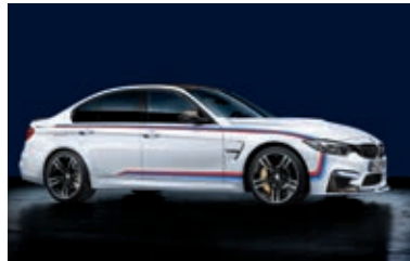
Motorsport side stripes