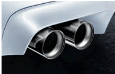
Exhaust tailpipe finishers, titanium