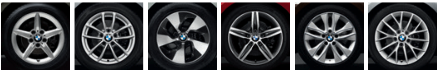
16" Star-spoke style 654 16" V-spoke style 378 16" Streamline style 406 17" Star-spoke style 379 17" V-spoke style 412 17" Y-spoke style 380