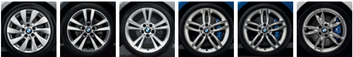
17" Turbine-spoke style 381 17" Star-spoked style 655 18" Double-spoke style 385 18" M Double-spoke style 461 M 18" M Double-spoke style 461 M, Ferric Grey 18" M Double-spoke style 436 M