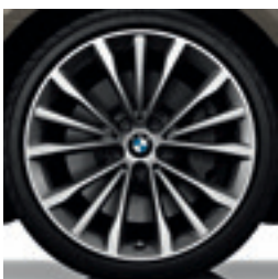
19" W-spoke style 663, Bi-colour