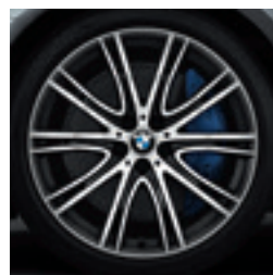
20" BMW Individual V-spoke style 759 I