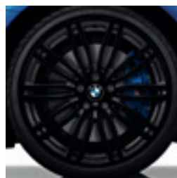
19" M Double-spoke style 664 M, Black