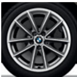
17" V-spoke style 618