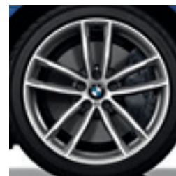
18" M Double-spoke style 662 M