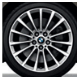
18" Multi-spoke style 619