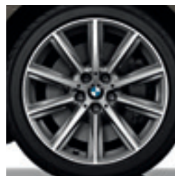
18" V-spoke style 684