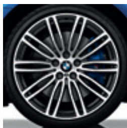
19" M Double-spoke style 664 M